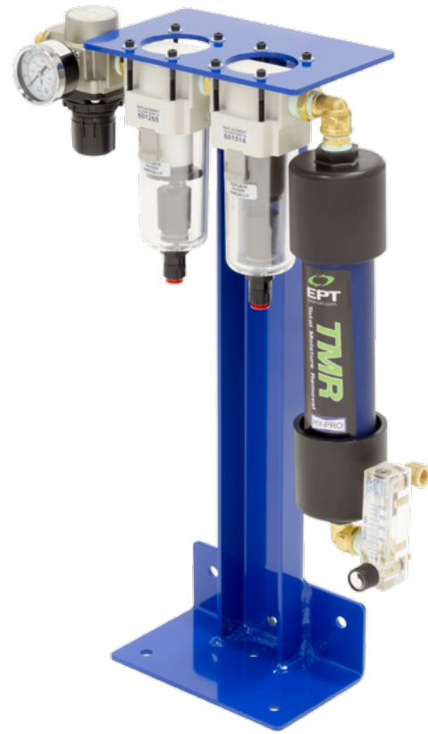
TMR™-Air Conditioned Reservoir